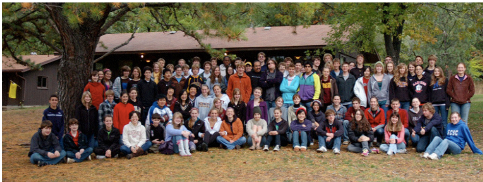
Symphony Orchestra takes time out for a group photo at YMCA Camp Pepin.

Our students are the legacy of MYS. We applaud them all and wish them well. They will forever be part of the MYS heart and soul.