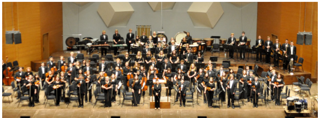
The Repertory Orchestra on stage at Orchestra Hall, October 2009